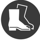
Wear safety footwear